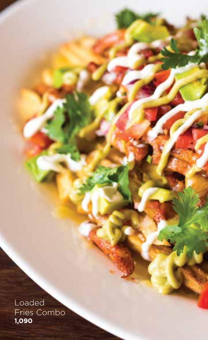
Loaded Fries Combo 1,090