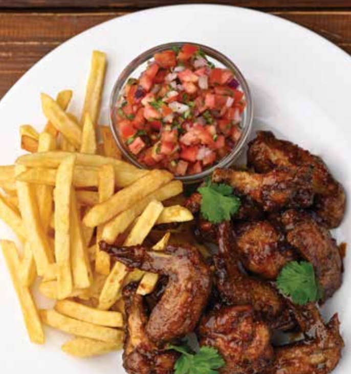
Sweet and spicy wings 1,100

Healthier Options ♥ Vegetarian ✓ Contains Nuts 🥜 Java Signature Items ☘